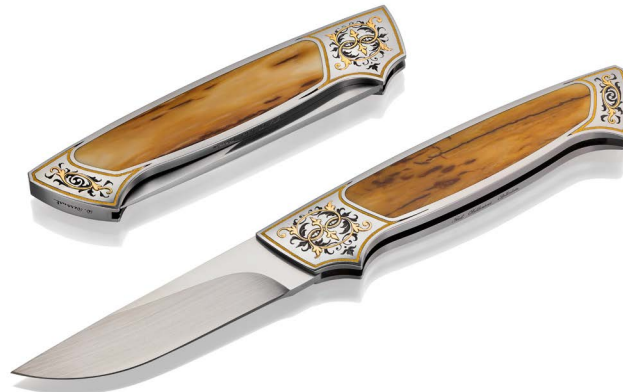
Original pocketknife inlaid with fossil mammoth ivory and 18ct rose gold. Fecit Hillknives Rotterdam 2013.

Working with the best engravers in Europe, Hillknives is among the top in its field and these collectors items are sold worldwide.