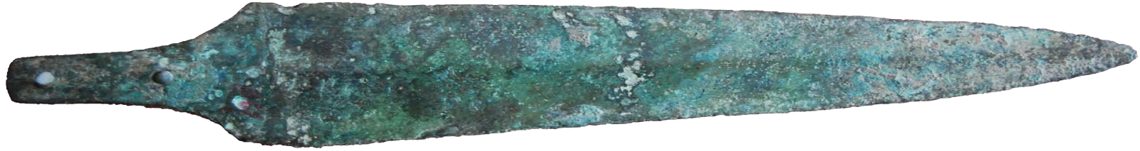
Bronze dagger, made in the Luristan age, 2500 till 800 years BC, found in North-Western Persia.

Over the centuries people have always made utensils, including knives; initially stone knives, later bronze and iron ones, and ultimately made of the highest quality steel.